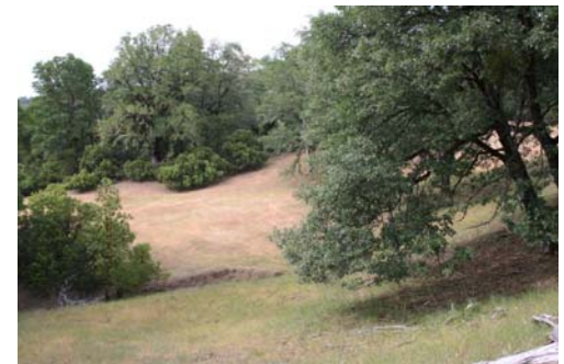
Building site with perc test