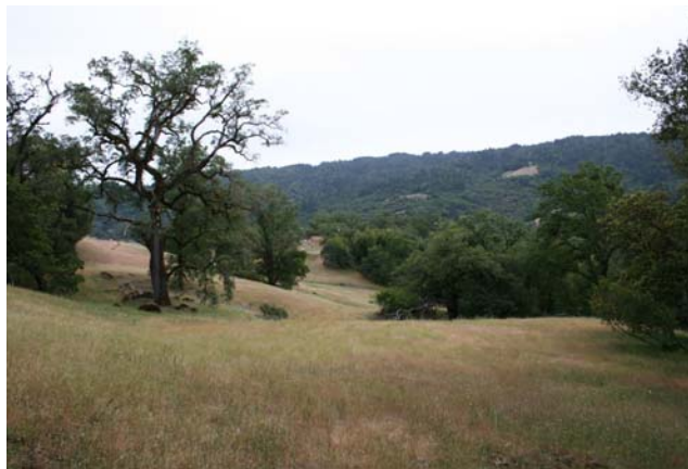
Gorgeous meadows with oaks