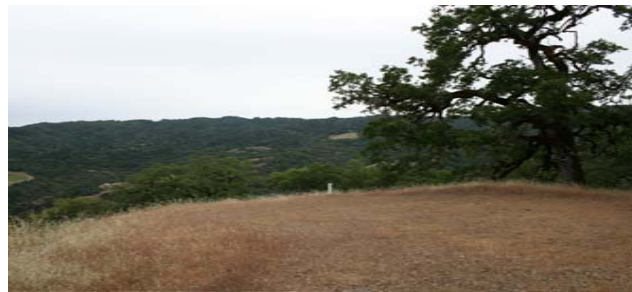
The property is only 25 minutes from Ukiah